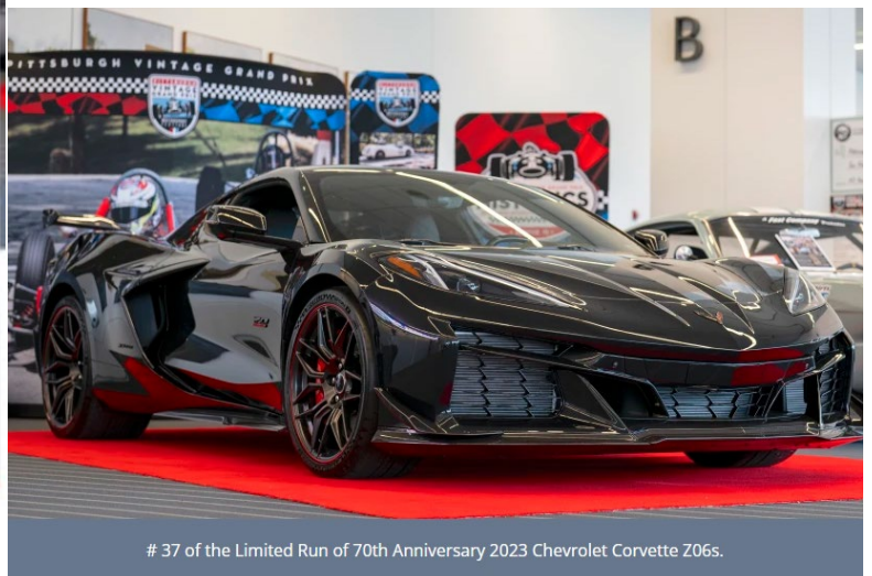
# 37 of the Limited Run of 70th Anniversary 2023 Chevrolet Corvette Z06s.

Please visit and link to us at pvgp.org/z06-sweepstakes/