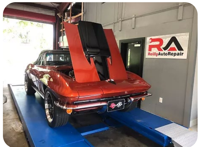
Jack Delong, Ambassador National Corvette Museum Delaware Valley Corvette Club

Application of any of these products is very simple. Clean the weather stripping with a soft cloth and take a small dab of the grease between the thumb and forefinger or use a soft cloth and rub it on all accessible areas. Let the lubricant remain on the weather stripping for an hour or so, and then carefully remove any excess with a soft towel. I do this several times a year and the results in preservation are excellent. If it turns white over time, you have applied too much lubricant; clean and repeat the process. Prevention of damage is just a simple chore with excellent long-term benefits and a good winter maintenance project.