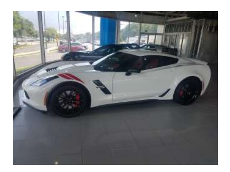
2019 Chevy Corvette Grand Sport Coupe 2LT with Auto transmission, Navigation, and grand sport heritage package with black aluminum wheels. MSRP $76.650 Club Price $66,885 Stock #12206