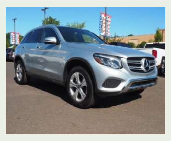
2018 Mercedes GLC300 All-Wheel Drive 2.0L turbocharged 4 cylinder with auto transmission. 2,447 miles Club Price $42,977