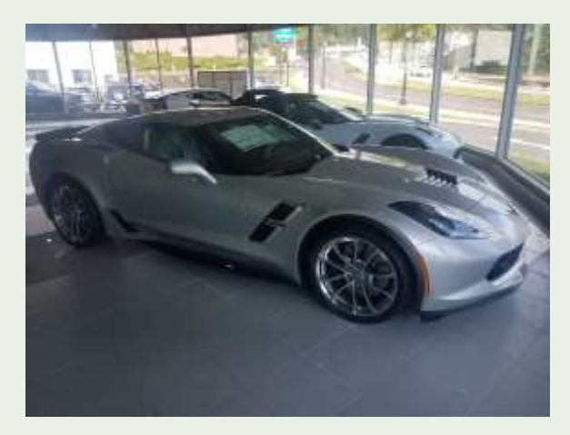
2019 Chevy Corvette Grand Sport Coupe 2LT with Auto Transmission, Navigation, and grand sport chrome wheels.

MSRP $76,660 Club Price $66,694 Stk# 12198