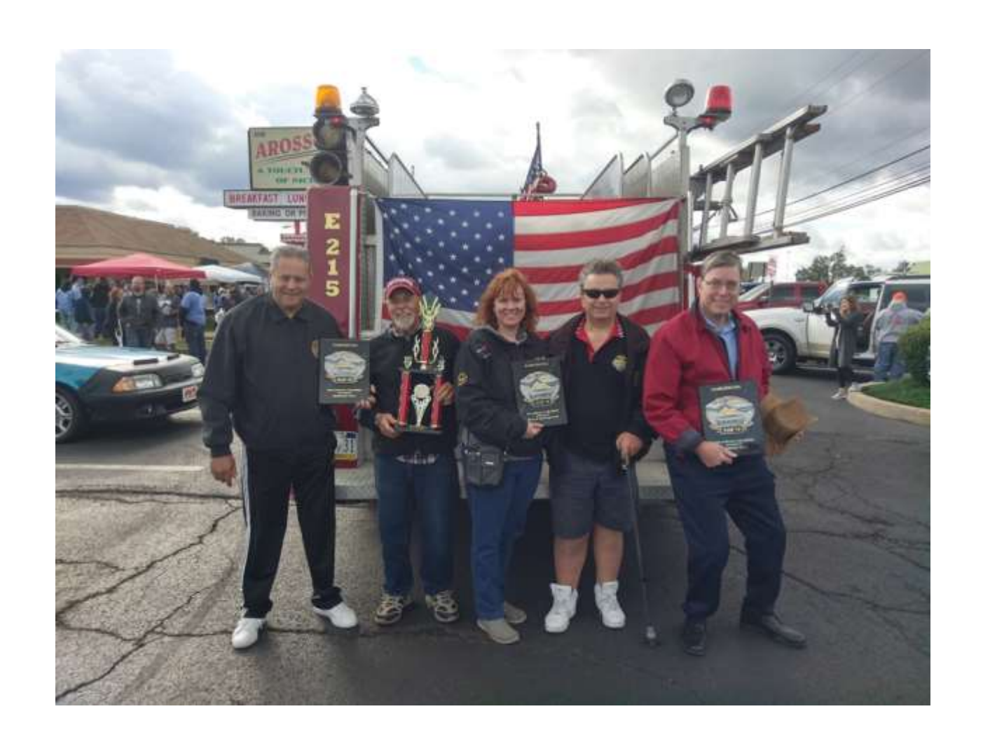
Here are the CCDV Trophy winners at the '18 FAMILIESCN2A Show. Pop Quiz: Which CCDV Vettester forgot his "blind-man" tin cup?