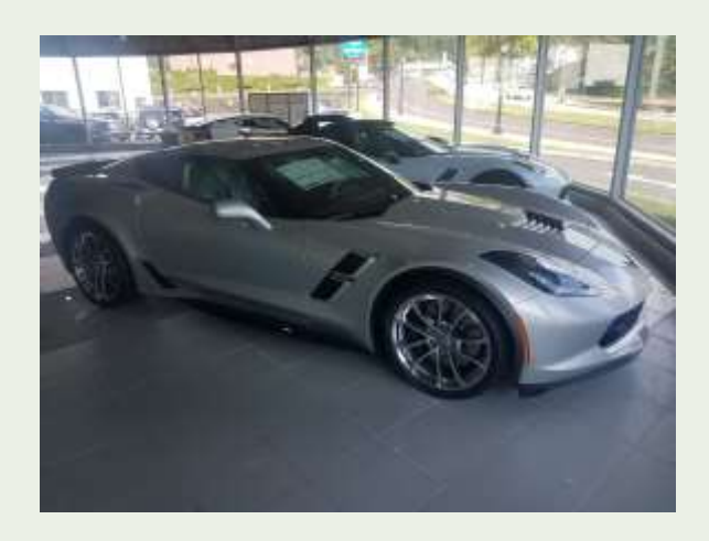
2019 Chevy Corvette Grand Sport Coupe 2LT with Auto Transmission, Navigation, and grand sport chrome wheels.

MSRP $76,660 Club Price $66,694 Stk# 12198