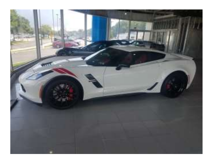
2019 Chevy Corvette Grand Sport Coupe 2LT with Auto transmission, Navigation, and grand sport heritage package with black aluminum wheels. MSRP $76.650 Club Price $66,885 Stock #12206