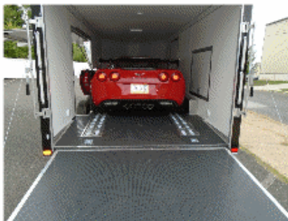
Easy Approach Won't Bottom Out