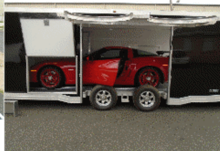
Low Clearance for Low Cars