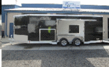
Wide Canopy Escape Door