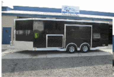
Tie Down Without Entering The Trailer

with the.... ALL ALUMINUM ATC CORVETTE CARRIER