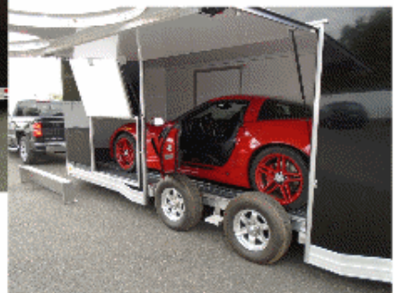
Many Options Available