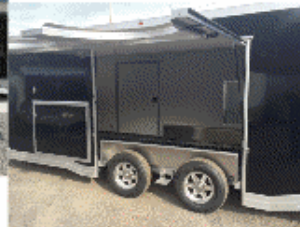
Removable Inner Fender