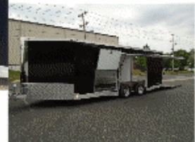
Over Tire E-Track Tie Down System