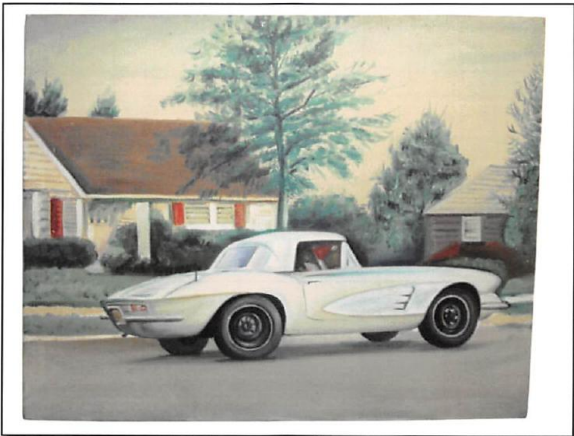
While serving in Vietnam in 1966-1967, I had a local Vietnamese artist hand paint my 1961 Corvette on canvas from a small photograph I showed her. It measures 15" x 20" and I still have the painting. It's the only tangible item I have today associated with my first Corvette.