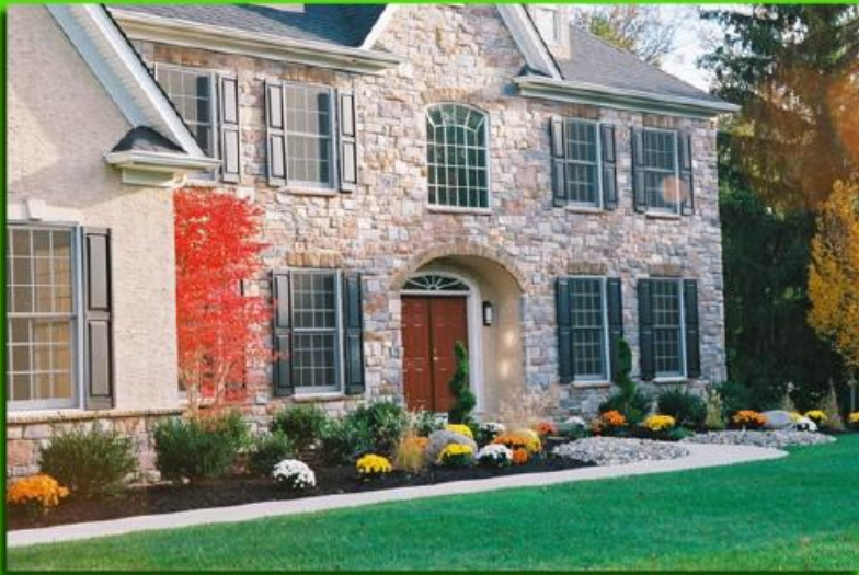
"Top Quality At An Affordable Price!"

FAMILY OWNED & OPERATED FOR OVER 32 YEARS!