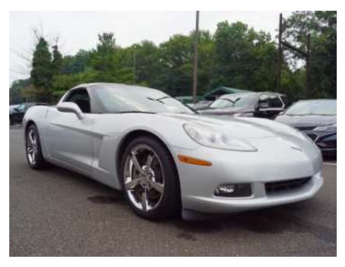
2010 Chevy Corvette Coupe LT With 41,420 miles on it. Blade silver with 6-speed manual transmission Sale Price 25.950 Stock #12362A