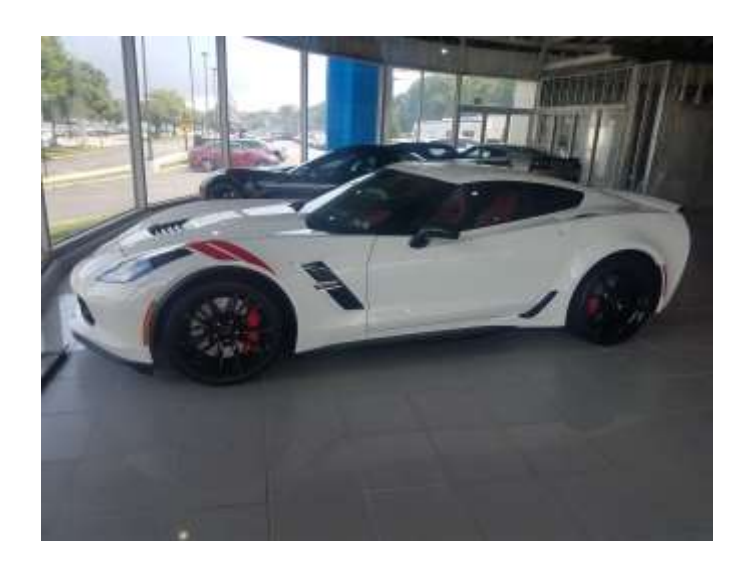
2019 Chevy Corvette Grand Sport Coupe 2LT with Auto transmission, Navigation, and grand sport heritage package with black aluminum wheels. MSRP $76.650 Club Price $66,885 Stock #12206