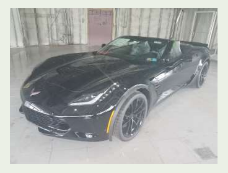
2019 Chevy Corvette Grand Sport Convertible 2LT, Auto, Performance data and video recorder MSRP 79,060 Club Price $68, 782 Stk#11798 Minus any available rebates 13% OFF!