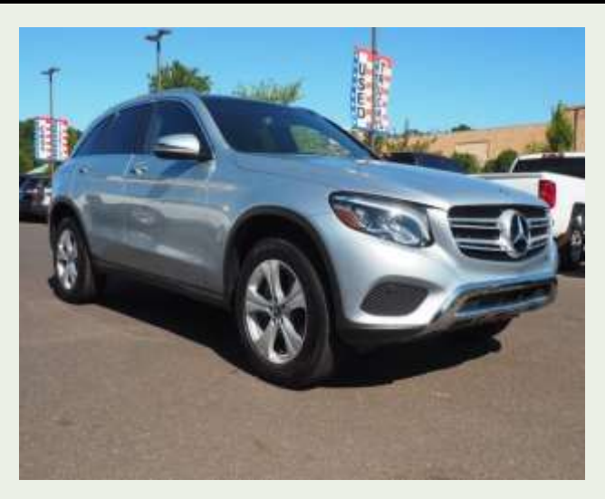
2018 Mercedes GLC300 All-Wheel Drive 2.0L turbocharged 4 cylinder with auto transmission. 2,447 miles Club Price $42,977