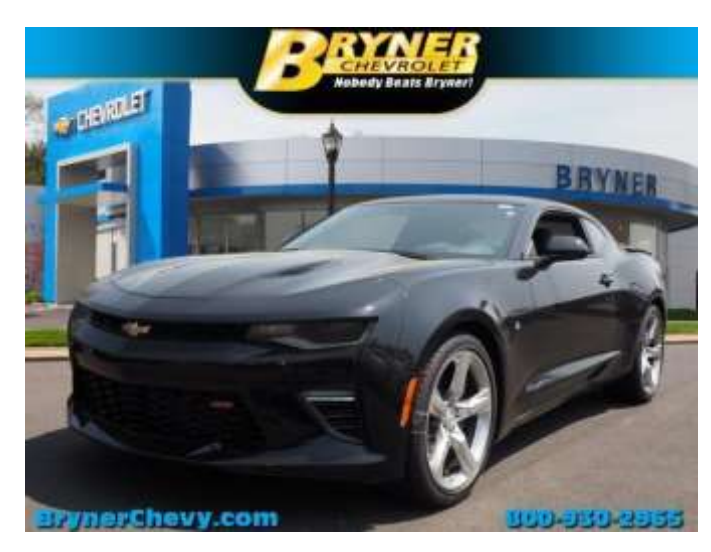
2018 Chevy Camaro 2SS Coupe Sunroof, AUTO and dual mode exhaust. MSRP $46,875 Club Price $43,969 Stock #12116 Minus available rebates.