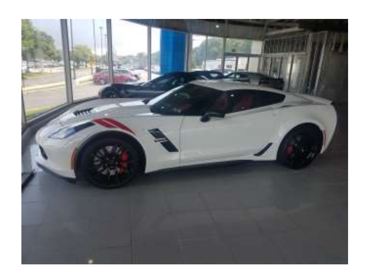
2019 Chevy Corvette Grand Sport Coupe 2LT with Auto transmission, Navigation, and grand sport heritage package with black aluminum wheels. MSRP $76.650 Club Price $66,885 Stock #12206