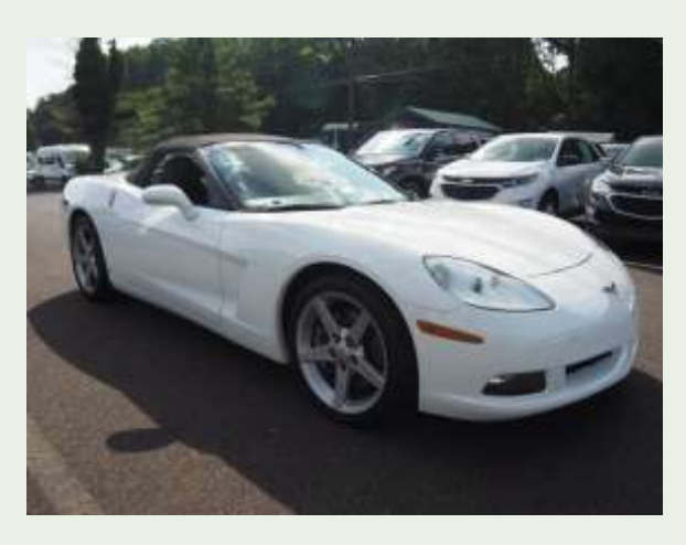
2007 Chevy Corvette Convertible Auto 2LT with 17,765 miles Club Price $28,999

MSRP $76,660 Club Price $66,694 Stk# 12198