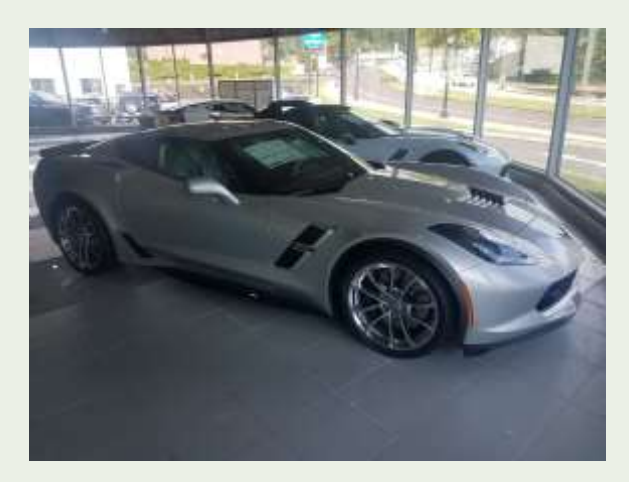
2019 Chevy Corvette Grand Sport Coupe 2LT with Auto Transmission, Navigation, and grand sport chrome wheels.

MSRP $76,660 Club Price $66,694 Stk# 12198