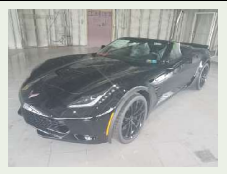
2019 Chevy Corvette Grand Sport Convertible 2LT, Auto, Performance data and video recorder MSRP 79,060 Club Price $68, 782 Stk#11798 Minus any available rebates 13% OFF!