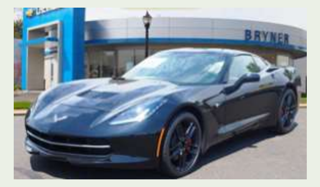
2018 Black 1LT Coupe 7-speed MANUAL Trans, Red Calipers, Multi-mode Exhaust, Black Painted Aluminum wheels MSRP $58,775 CLUB Price $51,135 Stk#11043 13% OFF