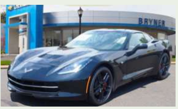
2018 Black 1LT Coupe 7-speed MANUAL Trans, Red Calipers, Multi-mode Exhaust, Black Painted Aluminum wheels MSRP $58,775 CLUB Price $51,135 Stk#11043 13% OFF