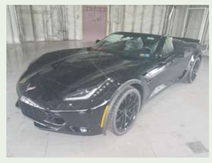
2019 Chevy Corvette Grand Sport Convertible 2LT, Auto, Performance data and video recorder MSRP 79,060 Club Price $68, 782 Stk#11798 Minus any available rebates 13% OFF!