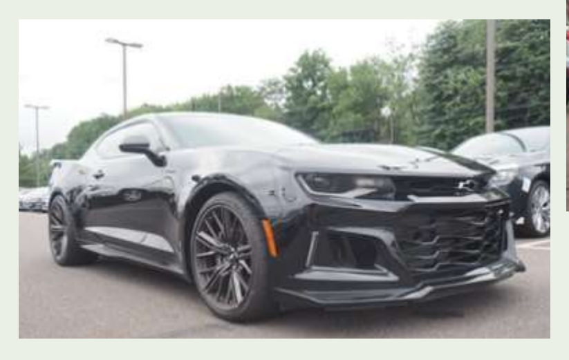
2017 Chevy Camaro ZL1 Supercharged 6.2 liter engine with 650 HP! Auto, sunroof, performance DATA recorder. Only 1,015 miles. Original MSRP $68,525 Club Price $55,950 plus tax and tags. Stk# 7243A