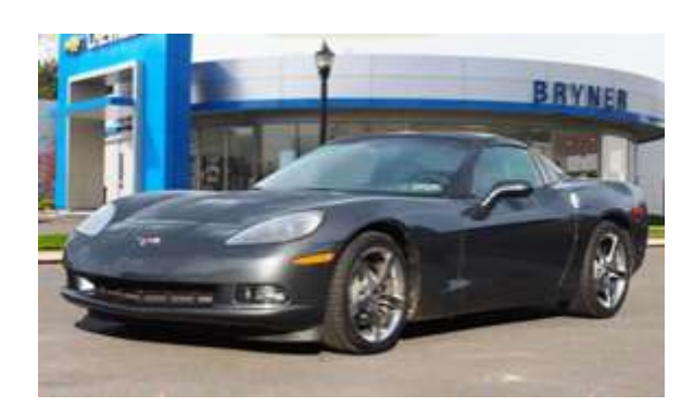
2010 Cyber Gray Coupe 1LT pkg., 6,2L 430hp V8, Auto, Transparent roof panel Club Price $28,499 Stk#6942A