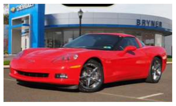
2013 Torch Red Coupe 2LT trim, 6.2L 430HP, Auto, NAV, Bluetooth. Club Price $33,500 Stock #10986B