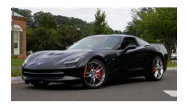
2014 Black Coupe 7-speed Manual, 3LT pkg., Transparent roof panel, Magnetic Ride Control, Multi-mode-Perf Exhaust, Z51 Perf Sport Handling ONLY 9,950 miles Club Price $49,950 Stk#10474A