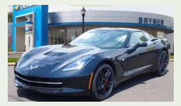
2018 Black 1LT Coupe 7-speed MANUAL Trans, Red Calipers, Multi-mode Exhaust, Black Painted Aluminum wheels MSRP $58,775 CLUB Price $51,135 Stk#11043 13% OFF

2019 Chevy Corvette Grand Sport Convertible 2LT, Auto, Performance data and video recorder MSRP 79,060 Club Price $68, 782 Stk#11798 Minus any available rebates 13% OFF!