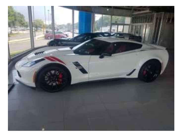
2019 Chevy Corvette Grand Sport Coupe 2LT with Auto transmission, Navigation, and grand sport heritage package with black aluminum wheels. MSRP $76.650 Club Price $66,885 Stock #12206

2018 Chevy Camaro 2SS Coupe Sunroof, AUTO and dual mode exhaust. MSRP $46,875 Club Price $43,969 Stock #12116 Minus available rebates.