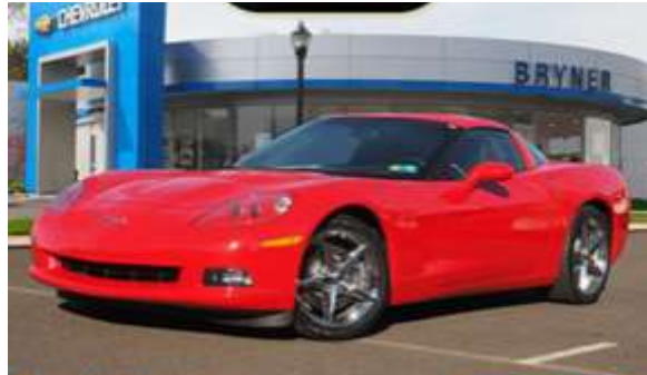
2013 Torch Red Coupe 2LT trim, 6.2L 430HP, Auto, NAV, Bluetooth. Club Price $33,500 Stock #10986B