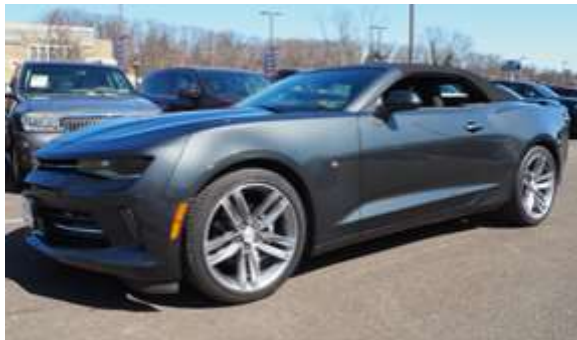
2018 Chevy Camaro LT Convertible 8973 miles. V-6 auto with remote start, power seat, Bluetooth for phone, 20" machined aluminum wheels and RS package Club Price: $26,884 Stk#7100AR