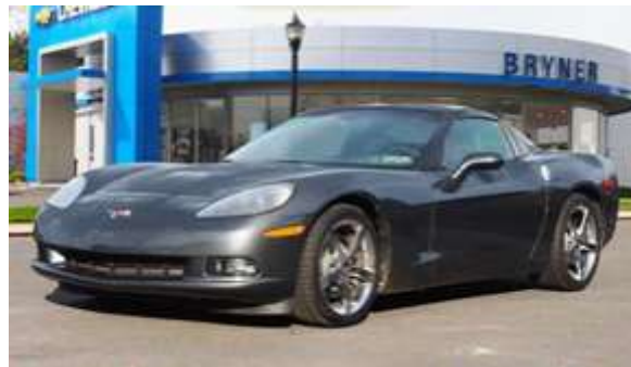
2010 Cyber Gray Coupe 1LT pkg., 6.2L 430hp V8, Auto, Transparent roof panel Club Price $28,499 Stk#6942A