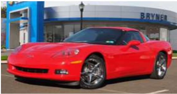
2013 Chevy Corvette Torch Red Coupe 2LT, 11,400 miles, 6 Speed Paddle Shift Auto, Chrome Aluminum Wheels, Heads Up Display Club Price: $32,950 Stk#10986B.