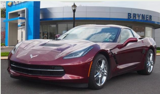
2017 Corvette Coupe Long Beach Red, 2LT, Auto, Perf. Exhaust Perf. Data & Video. MSRP $68,605 CLUB PRICE $61,745. #4795 10% OFF!