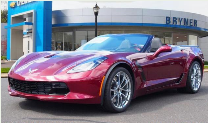
2017 Long Beach Red Grand Sport Convertible Black top & interior, Auto, 2LT pkg., ZO6 Performance Suspension. MSRP $79715 Club Price $71,743. #4703