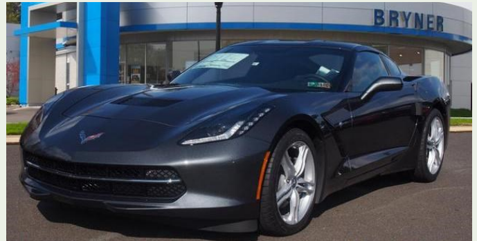
2017 Corvette Coupe Watkins Glen Gray, 1LT, Auto, Perf. Exhaust MSRP $59,365 Club Price $53,429. #4794 10% OFF!