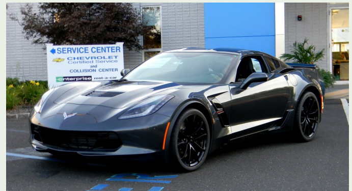
2017 Watkins Glen Gray Grand Sport Coupe 6.2L, 2LT, 8-speed Auto, Black Aluminum GS Wheels MSRP $73,120 CLUB PRICE $65,808. #4640 10% SAVINGS!

10% OFF MSRP ON ALL IN-STOCK 2017 CORVETTES TO CLUB MEMBERS