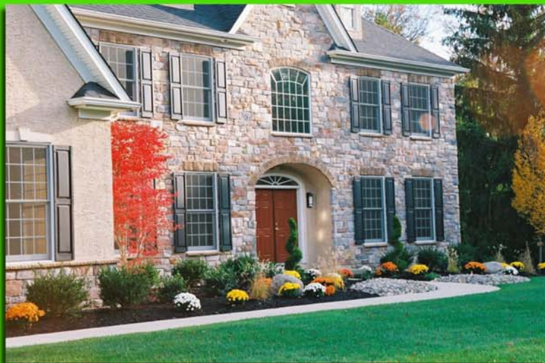
"Top Quality At An Affordable Price!"