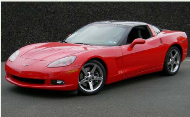
2007 Victory Red Corvette Coupe Z51 Performance Pkg., 3LT option group (Bose, XM, Head-up Display, Heated Leather Memory Seats), 400HP 6.0L w/6 speed manual trans., Chrome Aluminum Wheels, NAV and more. #2864B Sale Price $30,950 - New Club Price $32,450. Save an Additional $500!