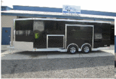
Tie Down Without Entering The Trailer

with the.... ALL ALUMINUM ATC CORVETTE CARRIER