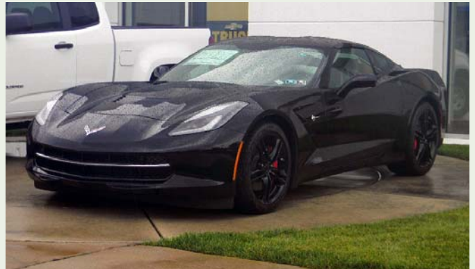
2016 Black on Black Z51 Corvette Coupe With visible carbon fiber roof panel. Heated and vented seats, curb view cameras, 8" MyLink with NAV & Apple Carplay, 4G LTE hotspot and more! $66,825 MSRP, Club Price $60,245.