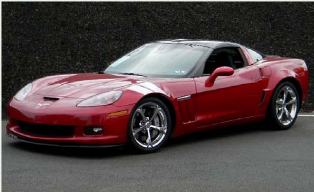
2011 Crystal Red Corvette Coupe—Grand Sport w/Z16 performance pkg., 3LT option group (Bose, Heated Leather Memory Seats, Dual Power Seats), 436HP 6.2L w/6-speed manual trans. Bluetooth, NAV, AUX, USB, and more #6041A. Special Club Price: $39,950 New Club Price $39,450, Save an Additional $500!