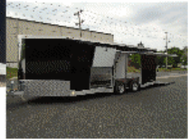
Over Tire E-Track Tie Down System