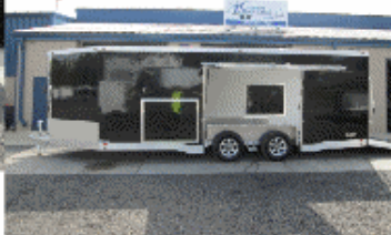
Wide Canopy Escape Door