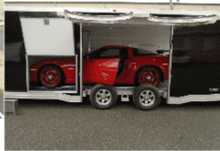
Low Clearance for Low Cars