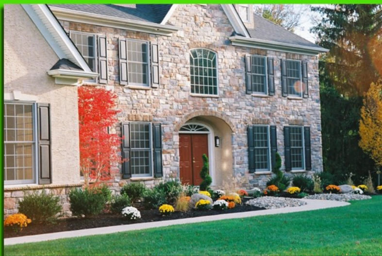
"Top Quality At An Affordable Price!"

FAMILY OWNED & OPERATED FOR OVER 32 YEARS!