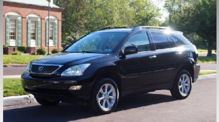
2009 Lexus RX-350- 3.5L V6, Sunroof, Heated Leather Memory Seats, Side Airbags, Rear AC and much more. ONLY 36,750 miles! $27,950. #5265A