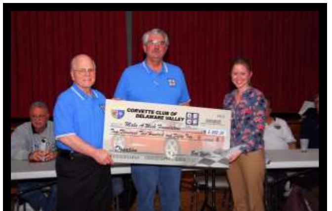
Make A Wish Foundation—$2,252