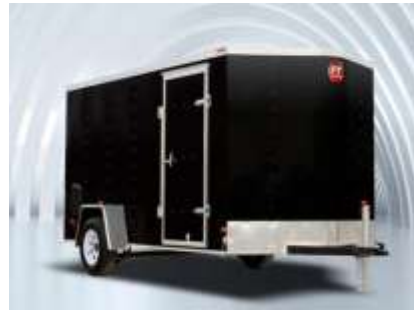
New Club Trailer!

Membership longevity is not a pre-requisite to volunteering. Anyone interested in accepting this role—even a brand new member—is welcome to do so. Interested members should contact me and I will be glad to go over things with you."