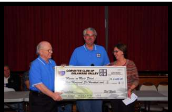
Manna on Main Street—$5,600