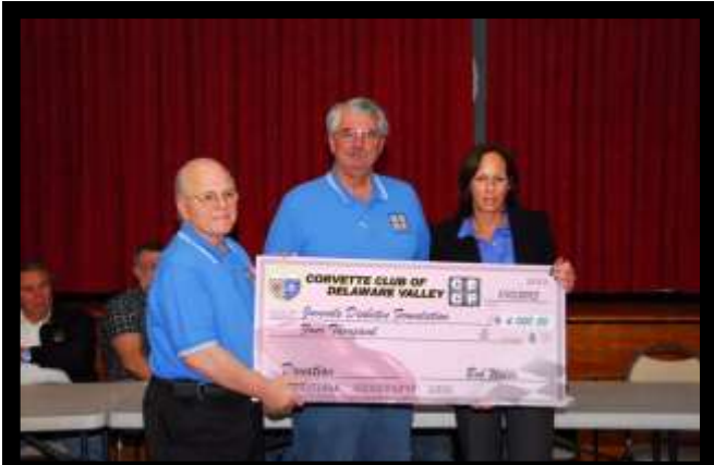
Juvenile Diabetes Research Foundation—$4,000

THANK YOU TO THE MEMBERS FOR THEIR HARD WORK SELLING RAFFLE TICKETS!