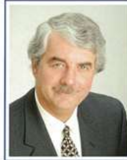
Each Office is Independently Owned And Operated.