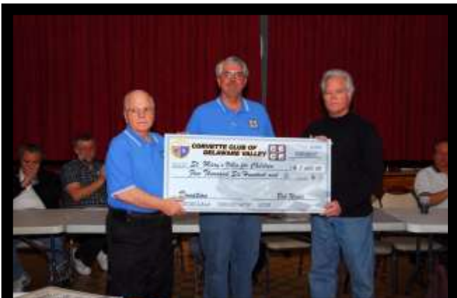
St Mary's Villa for Children—$5,600