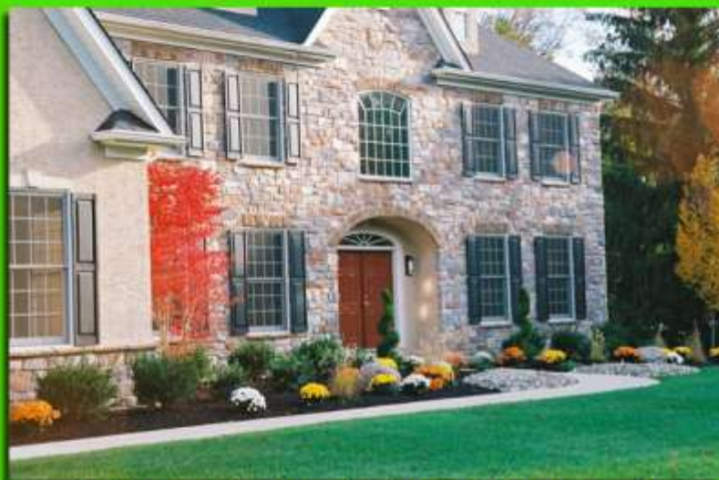
"Top Quality At An Affordable Price!"

FAMILY OWNED & OPERATED FOR OVER 32 YEARS!