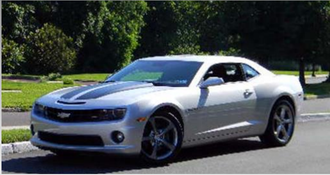
2011 Camaro SS- 6.2L V8, Tap-shift Auto Trans, RS Trim Pkg., Sport Bucket Dual Power Seats, 3.27 Ltd. Slip Rear, AUX-XM-CD Stereo. $26,950. #5312A