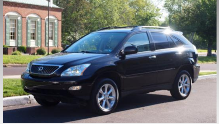
2009 Lexus RX-350- 3.5L V6, Sunroof, Heated Leather Memory Seats, Side Airbags, Rear AC and much more. ONLY 36,750 miles! $27,950. #5265A