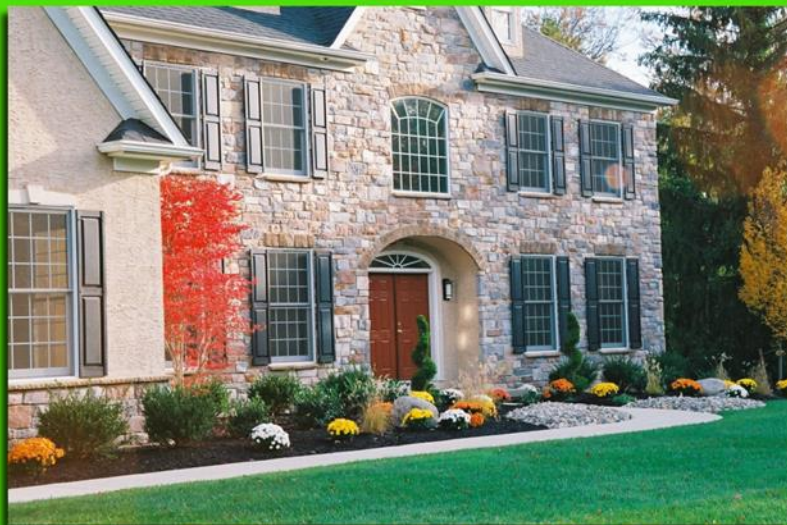
"Top Quality At An Affordable Price!"

FAMILY OWNED & OPERATED FOR OVER 32 YEARS!