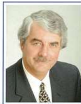
Each Office is Independently Owned And Operated.