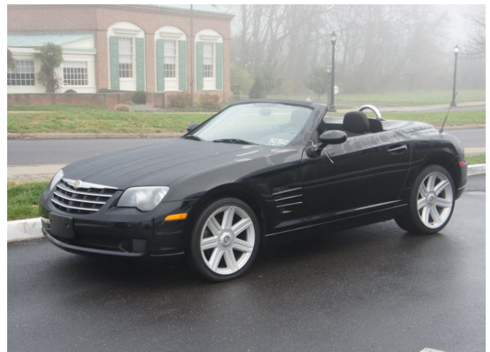
2005 Chrysler Crossfire Convertible – ONLY 18,000 miles! 6-speed manual, black power top, power windows and more. #4620A $17,750.

BRYNER IS COMPETITIVE WITH ALL OTHER CORVETTE DEALERS IN THE AREA