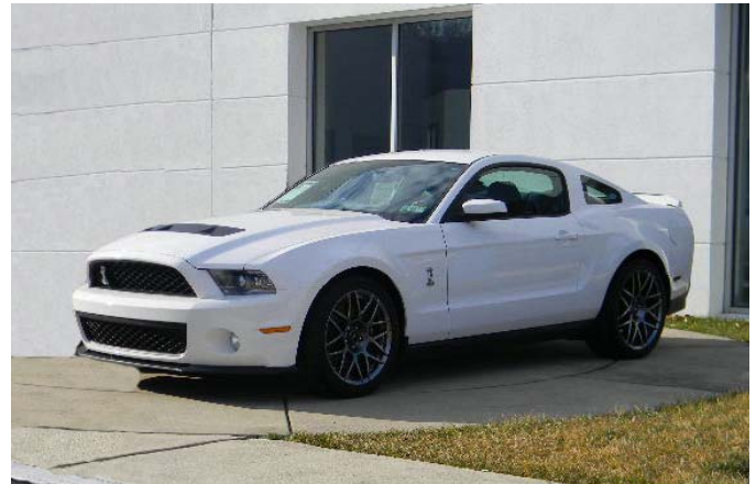
2011 Ford Mustang Shelby GT500 Cobra – 550HP V8, 6-speed, Navigation, Bluetooth. ONLY 2600 miles. $46,500.