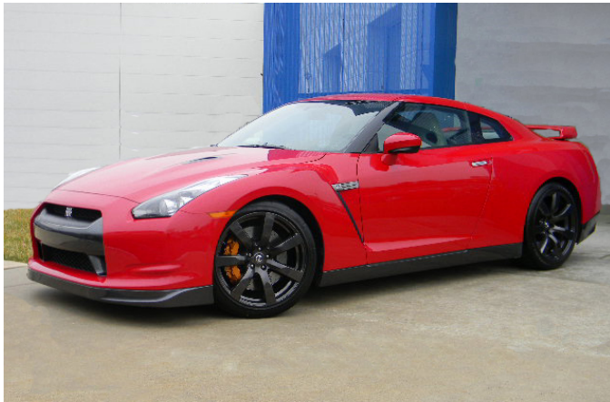
2010 Nissan GT-R Coupe – All-Wheel-Drive, 485 HP, Twin Turbo V6, 6-SPEED only 6800 Miles. $73,950

Bryner Chevrolet is proud to be the official sponsor of the Corvette Club of Delaware Valley.