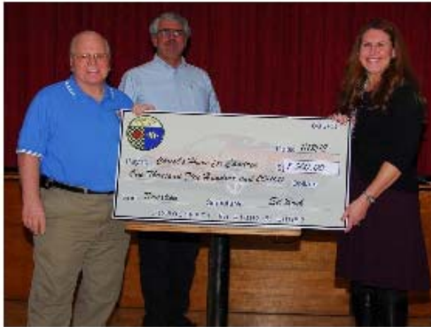
$1,500 Donated to Christ Home for Children