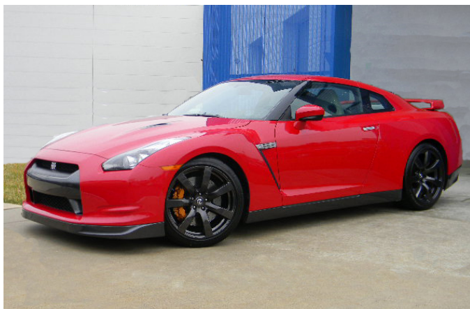
2010 Nissan GT-R Coupe – All-Wheel-Drive, 485 HP, Twin Turbo V6, 6-SPEED only 6800 Miles. $73,950

Bryner Chevrolet is proud to be the official sponsor of the Corvette Club of Delaware Valley.