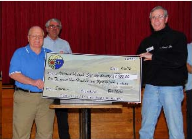
$1,950 Donated to Multiple Sclerosis