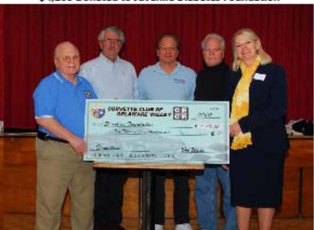
$5,700 Donated to Sunshine Foundation