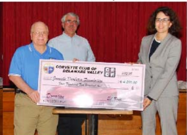
$4,200 Donated to Juvenile Diabetes Foundation