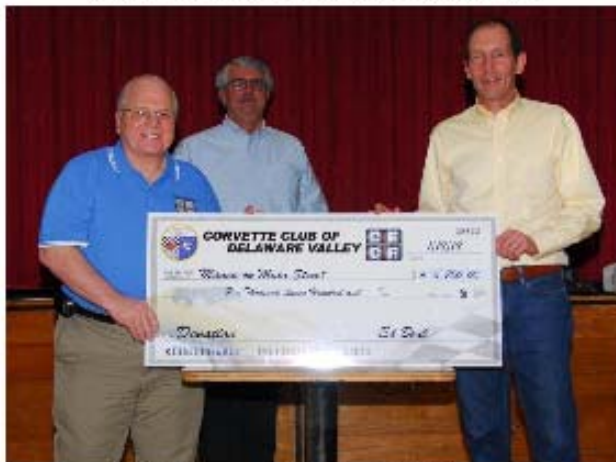
$5,700 Donated to Manna On Mainstreet