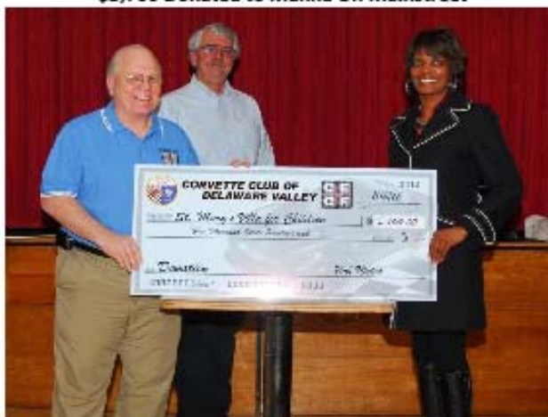
$5,700 Donated to St. Mary's Villa for Children