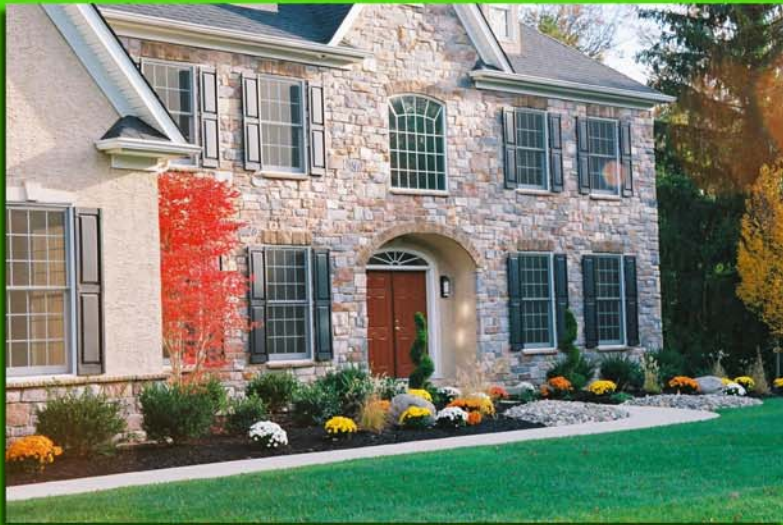
"Top Quality At An Affordable Price!"

FAMILY OWNED & OPERATED FOR OVER 32 YEARS!