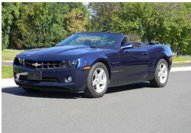
2011 Camaro Convertible – Imperial Blue, V6, Automatic, Side Airbags, Power Seat, On-Star. Only 7,100 miles. $26,950 #4546AR

Bryner Chevrolet is proud to be the official sponsor of the Corvette Club of Delaware Valley.