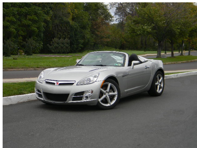
2007 Saturn Sky Convertible – Silver, Automatic, 4cyl., Power Windows, and much more. ONLY 13,500 miles. $16,950 #6989A

BRYNER IS COMPETITIVE WITH ALL OTHER CORVETTE DEALERS IN THE AREA