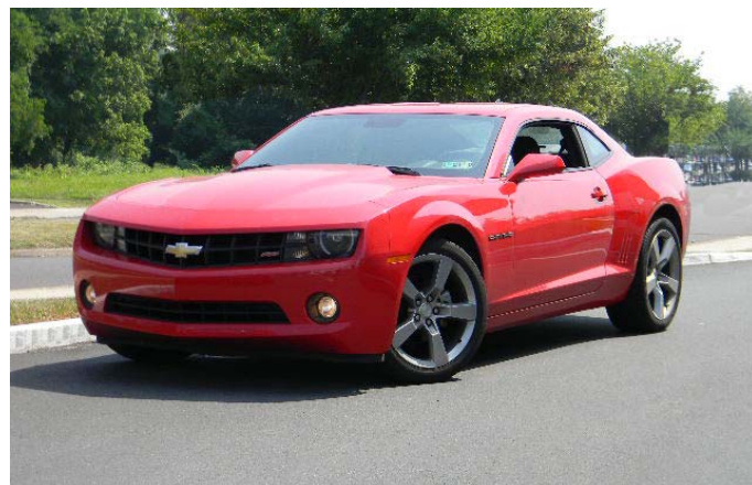
2010 Camaro LT/RS – 308HP V6, 6-Speed Shiftable Automatic, Full Powers, Head-Curtain Airbags, Boston Acoustics Audio System. $23,950 Club Price. #4398B