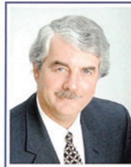
Each Office Is Independently Owned And Operated.