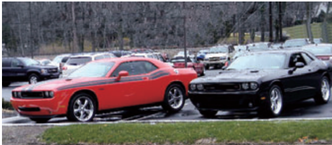
2010 Dodge Challenger R/T – Two to Choose! 6-speed, Hemi V8, Full Power Options, Leather Interior. Mopar's finest! Starting at $32,950

Bryner Chevrolet is proud to be the official sponsor of the Corvette Club of Delaware Valley.