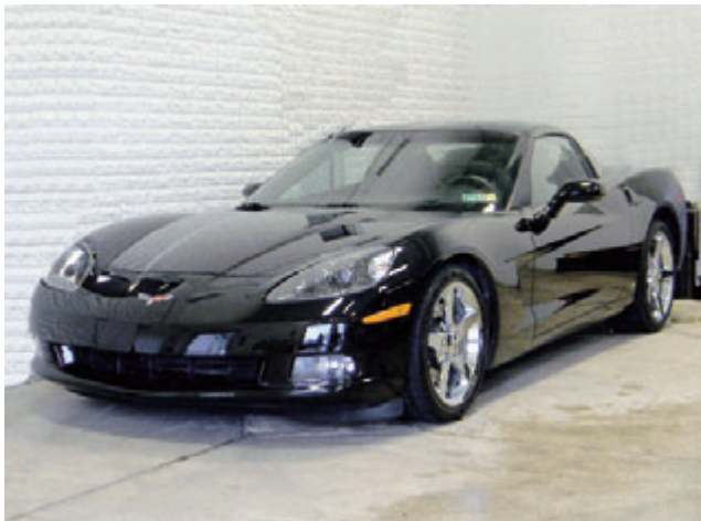
2007 Corvette Coupe – Black on Black, 6.0L 400HP with 6-speed manual gears, solid removable top, chrome aluminum Wheels, MP3/CD stereo. $36,750 ONLY 3,450 Mi.!