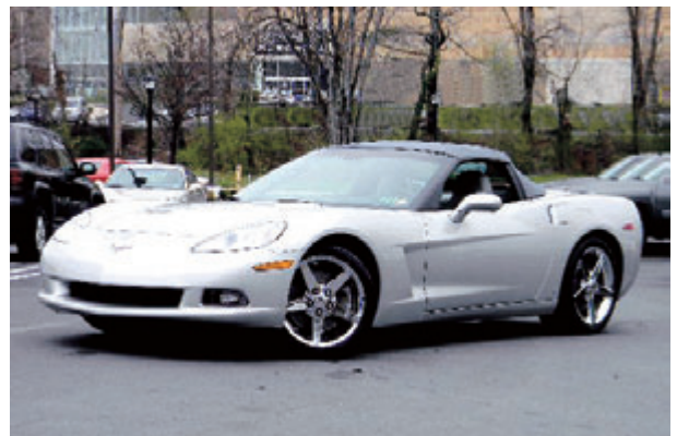
2007 Corvette Convertible 3LT (loaded) Machine Silver with a Dark Gray power top, Magnetic Adjustable Ride & Handling Pkg., Heated memory seats, Head-up display, XM radio, Only 33K miles. $42,750. #4261A

BRYNER IS COMPETITIVE WITH ALL OTHER CORVETTE DEALERS IN THE AREA