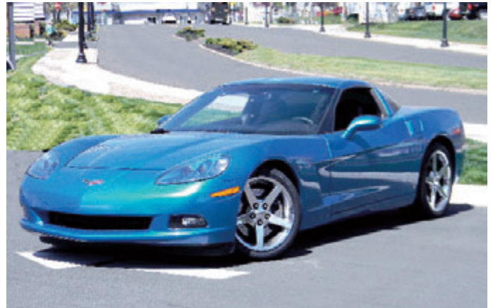
2008 Corvette Coupe – Jetstream Blue 1LT, 6-speed paddle-shift, Auto Trans, Z51 performance pkg., CD/MP3/XM stereo. Only 20K mi. $38,750. #4258A