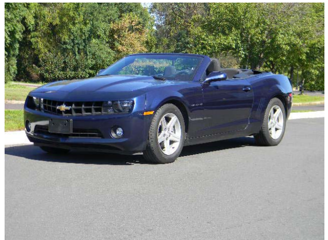
2011 Camaro LT Convertible – 6,000 miles, Auto trans, Full power options. $26,750. #4546AR

BRYNER IS COMPETITIVE WITH ALL OTHER CORVETTE DEALERS IN THE AREA