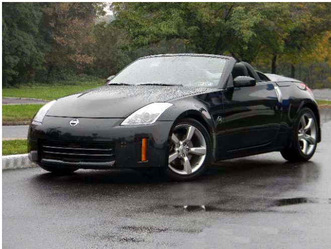
2007 Nissan 350Z Convertible – Magnetic Black, 3.5L V6, Heated Leather Power Seats, Navigation, 6-disc Changer. 44,700 miles. $23,750 #4300B