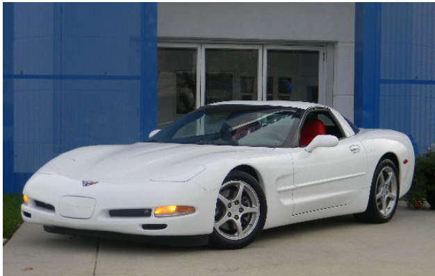
2000 Corvette Coupe – ONLY 36,300 miles, one-owner, garage kept, Auto trans, Red interior. $20,750.00, Stock #7065A

Bryner Chevrolet is proud to be the official sponsor of the Corvette Club of Delaware Valley.