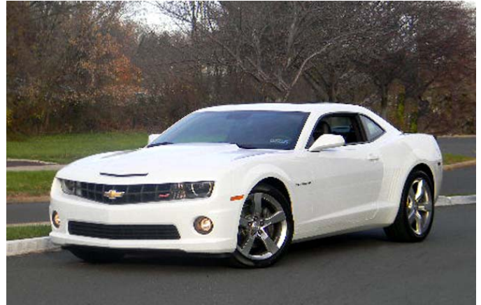
2010 Camaro Coupe – ONLY 3,100 miles, 2SS/RS package, 6-speed manual, Leather interior, garage kept. $29,950. #7158A