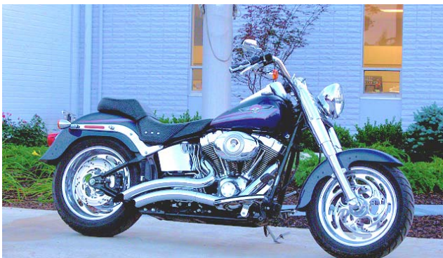
2007 Harley Davidson Fat Boy

We will be holding a GRAND OPENING ceremony sometime soon