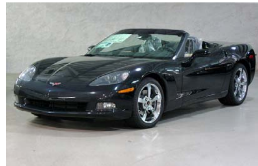
2010 Corvette 6-speed Convertible

Black, Black Power Top, 2-tone heated leather seats, 4LT pkg., NAV, Dual Mode Exhaust, Polished Wheels. Stk. #9229, $69,025.00, MSRP, Club Price $57,425.00, Includes $3,000 factory rebate SAVE $11,600.00