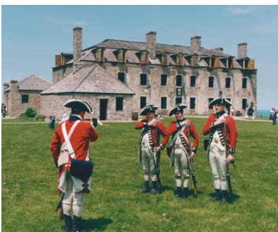
Old Fort Niagara