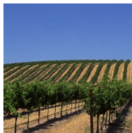
'Niagara on the Lake'

You will need a passport to gain entry into Canada. An option is a U.S. Passport Card this will allow you to drive into Canada. It is cheaper than a Passport. CLICK FOR INFO