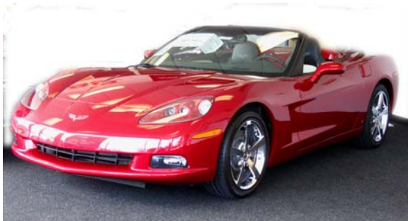
Brand New 2009 Crystal Red Corvette Convertible – Stock #8203. $71635 MSRP. CCDV CLUB PRICE NOW $55,950, with $5500 in rebates or 72 Month 0% financing

Bryner Chevrolet is proud to be the official sponsor of the Corvette Club of Delaware Valley.