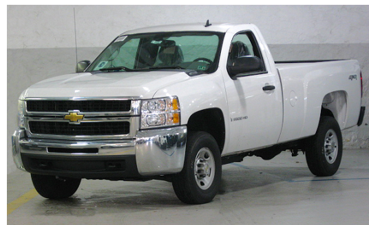
2009 Silverado 2500 4X4 with 6.0 V8, Snow Plow prep pkg, XM, CD, ON-STAR, locking differential, 400 miles. #8689A $32,675 MSRP. Now only $24,750!