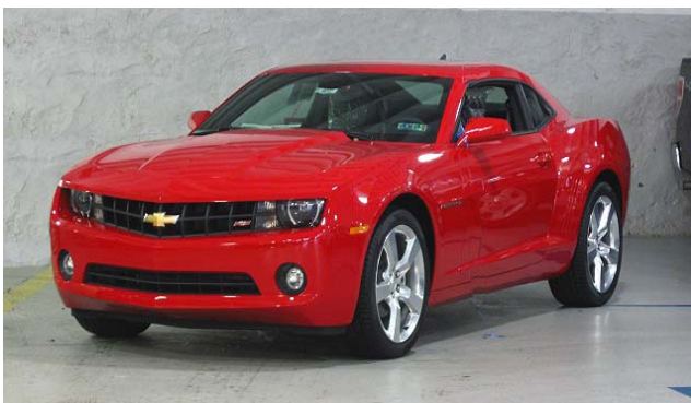
2010 Camaro 2LT with RS package, sunroof, 20" polished aluminum wheelos, remote vehicle start, leather seats 304HP/273lb-ft torque V6 w/6-speed auto trans. Includes Bluetooth and USB functions. #9022 $31880 MSRP, $500 rebate.