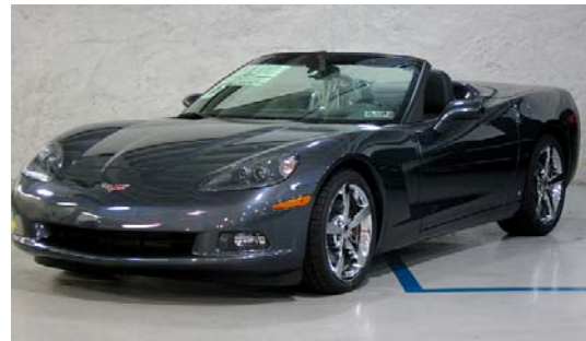
Brand New 2009 Cyber Gray Convertible –. Stock #8343. $65415 MSRP CCDV CLUB PRICE NOW $51,250, With $5500 in rebates or 72 month 0% financing!