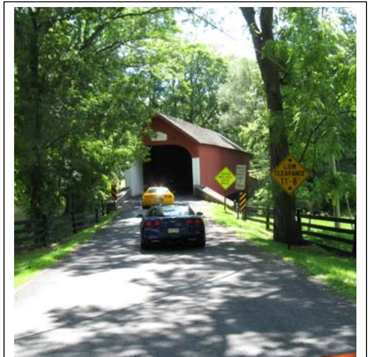
2009 Covered Bridge Poker Run