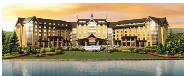
Mt. Airy Casino Resort in the Poconos

I can put you in any car Fred Beans sells at Club rates (except Corvettes)