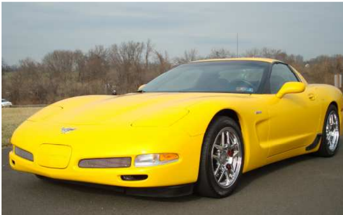
Wayde and Denise Ewell's 2003 Z06

Members interested in having their Corvette's picture shown here are encouraged to send a picture and some history of their interest in automobiles and facts of their Corvette to Bill Burkholder at: wburkholder4@comcast.net .